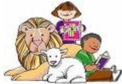
Growing in Faith

Children's Sunday summer programs will begin May 24 th . Adults are needed to volunteer for one or two Sundays during the summer months. This is a great time to plan a Bible story activity for the creative children of our parish. A sign-up sheet is located at the ushers' station in the rear of the Sanctuary. Adult participation is greatly appreciated.